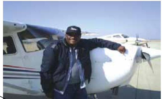
FULL-SCALE CESSNA 182