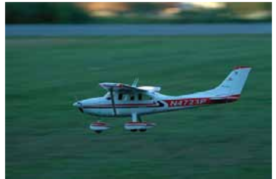
1/4 SCALE RC CESSNA 182

One of the first pre-flight checks is control surfaces functionality, which is critical to a successful flight. In full-scale, you actually have to get into the cockpit and turn the steering mechanism that controls the ailerons. The pedals are used to steer the aircraft as well as control the rudder. On an RC plane, checking these surfaces is achieved by rotating the sticks on the remote control . In either case, the pilot is reassured that full control of the plane is achieved.