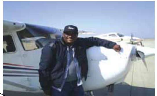
FULL-SCALE CESSNA 182