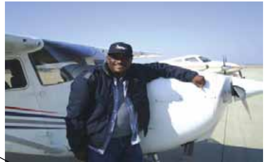
FULL-SCALE CESSNA 182